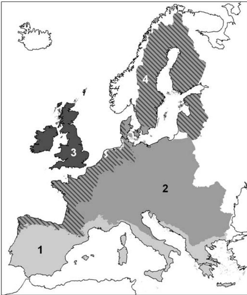
Figure 1 Delimitation of areas where the level of invasion was mapped, based on different data sources: 1, Catalanian data, 2, Czech data, 3, British data, 4, mean of Czech and British data. Boundaries between the areas follow the map of European biogeographical regions (European Topic Centre on Biological Diversity, 2006) and the areas correspond to 1, Mediterranean region, 2, Continental and Pannonian regions, 3, British Isles and 4, remaining part of Atlantic and Boreal region.

vegetation plots assigned to EUNIS habitats were used for extrapolations within particular biogeographical regions as follows: (1) the Mediterranean region was based on the Catalanian data; (2) Continental and Pannonian regions, including embedded patches of the Alpine region, on the Czech data; (3) British Isles on the British data; and (4) the remaining part of the Atlantic region and the Boreal region, including the embedded patches of the Alpine region, on average values obtained from British and Czech data (Fig. 1). We believe that this averaging provided a good approximation for the areas of Atlantic region on the European continent, because of their transitional biogeographical position between oceanic and subcontinental climates. Average values from the British and Czech data also provide a reasonable extrapolation for the Boreal region, because Scottish and Czech mountains contain most of the habitats typical of the Boreal region, such as coniferous forests, alpine grasslands and mires. Anatolian, Arctic, Black Sea, Macaronesian and Steppic biogeographical regions were omitted because of the lack of appropriate vegetation data to justify extrapolation.